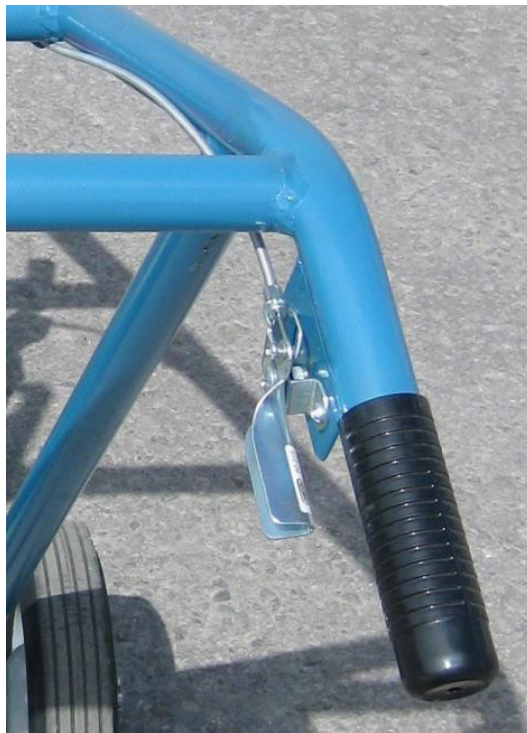
Fig.6 Throttle control

The throttle is located on the right hand side (see Fig. 6). To actuate choke, lever must be in fully contracted position (all the way down). Push the throttle control slightly to find full throttle position, and pull farther up for lower speed settings. To stop the engine, pull all the way up on control lever. Lowering control lever increases the engine speed. Raising the control lever decreases the engine speed.