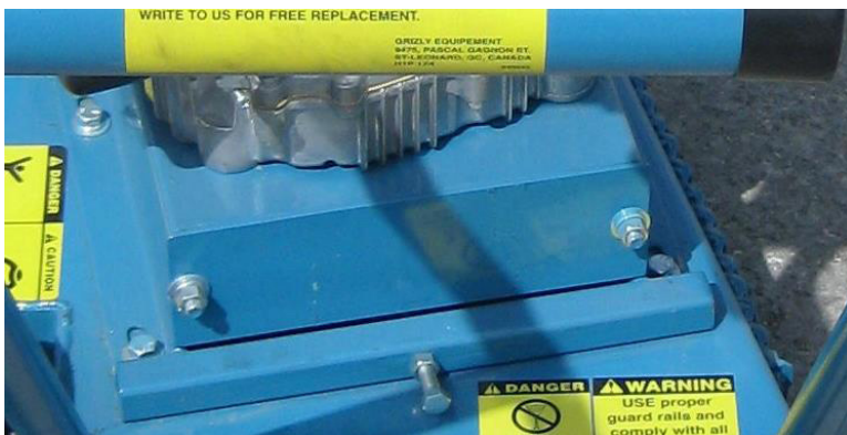
Fig. 8 Dust plate

Belt adjustment may be necessary at times. To inspect belt remove dust plate on back of motor mount (see Fig. 8). Push down on the belt with your thumb midway between pulley with about 20 lbs. pressure. When properly adjusted you should get a deflection of nearly 3/4". To adjust belt, loosen 4 bolts on engine mount (item 101 on parts list). Then loosen locknut on belt adjustment bolt, shown in Fig. 9. Turn bolt clockwise to tighten belt, counter clockwise to loosen. When desired tension is set, re-tighten the locknut and also the four engine mount bolts. If belt replacement is necessary, remove belt cover (item 4 on parts list) by removing two bolts. Replace belt cover after changing belt. Tighten bolts securely.