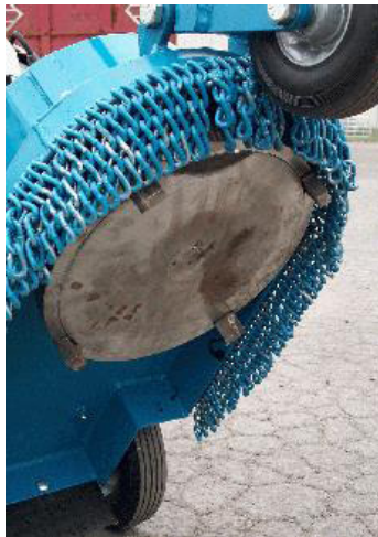
Fig. 7 Carbide blocks on disc planer

When installing new blocks, countersink side of block faces out. Use care to align screw properly and turn evenly; damage to threads could otherwise result. Make certain the blocks are tightened securely. See Fig. 7, illustration of blocks installed on the planning disc.