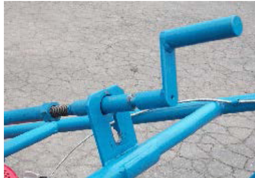
Fig.5 Depth control in operating position