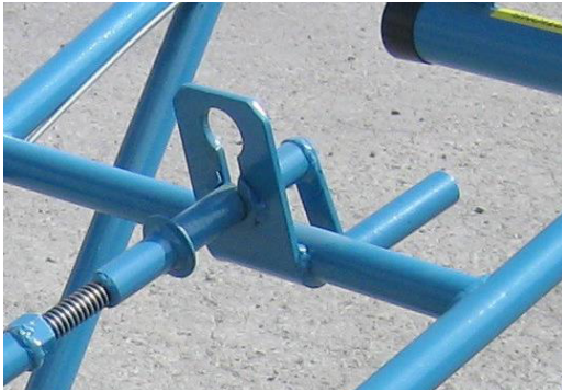
Fig.4 Depth control in idle position

The depth control (see Fig. 4 and Fig. 5) is located on the centre of the machine, just over the engine. Fig. 4 shows the control in the idle position and Fig. 5 shows the planning position. Turning the crank clockwise adjusts the planning depth lower; counter-clockwise rotation of crank raises the planning disc. Operator must be familiar with operation of this control before using planer on the job.