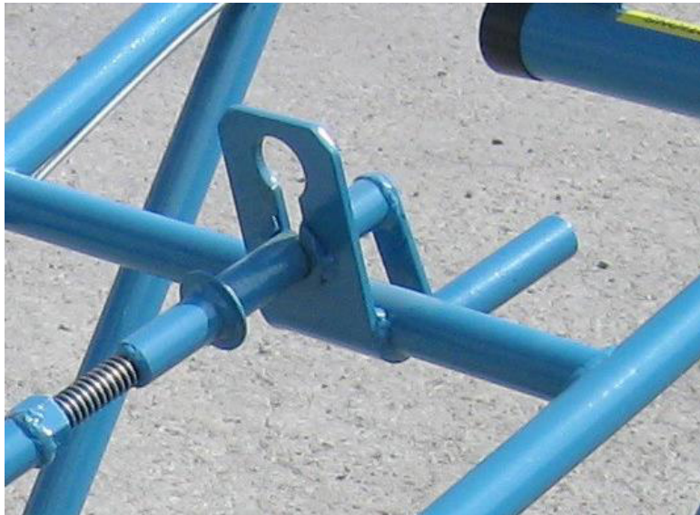
Fig.3 : Planer in idle position

After checking the planer disc and blocks (refer to the planer block installation section), put the depth control in the idle position and make certain the control is set so that the blocks do not come in contact with the roof deck (see Fig. 3). Pushing down on the handles will allow the depth control to slide to the idle position.