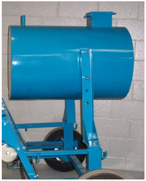
Fig. 8 Hot stuff tank attachment

Install channel irons, tank and rods as shown in Fig. 8 (Refer to operation section on use of hot tanks)