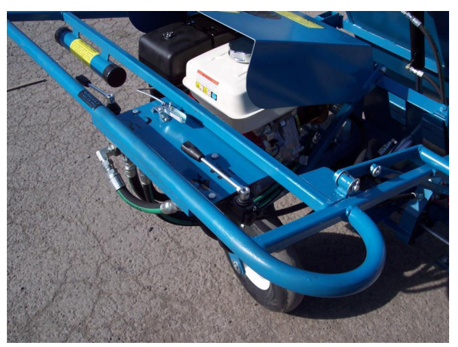
Fig. 9 All levers on neutral, brake on

At this point, after you have read through all of the instructions, the workhorse should be ready for operation.