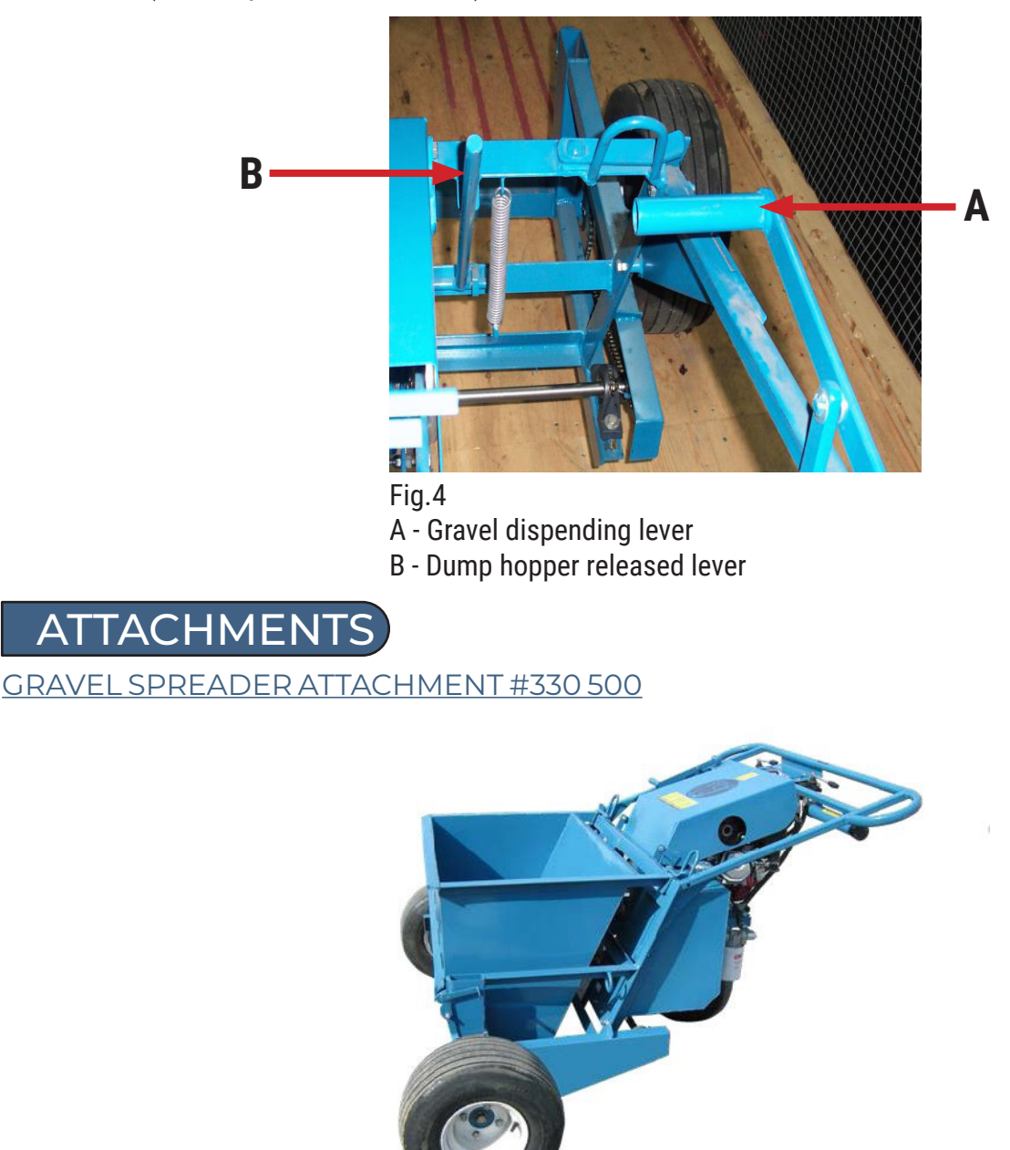
Fig. 5 Gravel spreader

Gravel dispensing lever (A) is located furthest to the right (Fig. 4.) Pulling back on handle opens discharge door of gravel dispenser. Pushing forward on lever closes door. For instructions on installation of linkage and lever, refer to next section (Gravel spreader attachment)