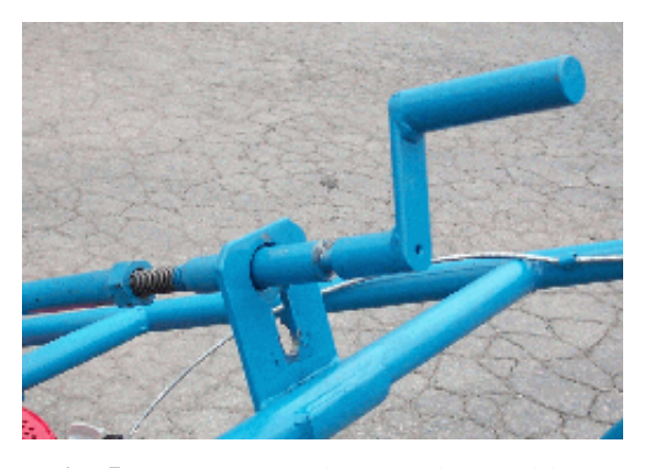
Fig. 5 Depth control in operation position