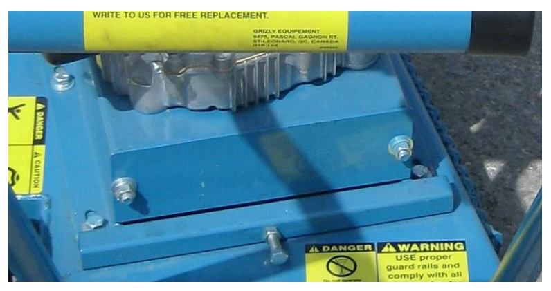
Fig. 8 Dust plate

Belt adjustment may be necessary at times. To inspect belt remove dust plate on back of motor mount (see Fig. 8). Push down on the belt with your thumb midway between pulley with about 20 lbs. pressure. When properly adjusted you should get a deflection of nearly 3/4". To adjust belt, loosen 4 bolts on engine mount (item 101 on parts list). Then loosen locknut on belt adjustment bolt, shown in Fig. 9. Turn bolt clockwise to tighten belt, counter clockwise to loosen. When desired tension is set, re-tighten the locknut and also the four engine mount bolts. If belt replacement is necessary, remove belt cover (item 4 on parts list) by removing two bolts. Replace belt cover after changing belt. Tighten bolts securely.