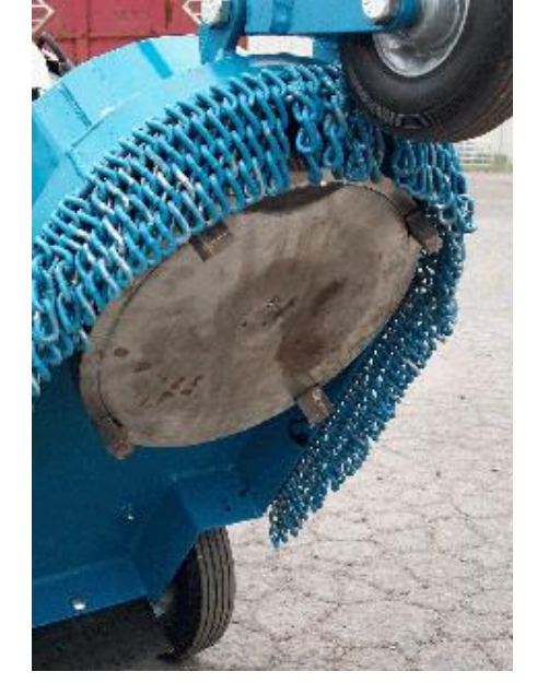
Fig. 7 Carbide blocks on disc planer

When installing new blocks, countersink side of block faces out. Use care to align screw properly and turn evenly; damage to threads could otherwise result. Make certain the blocks are tightened securely. See Fig. 7, illustration of blocks installed on the planning disc.