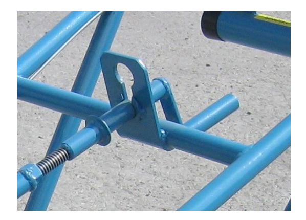
Fig. 4 Depth control in idle position

The depth control (ser Fig. 4 and Fig. 5) is located on the centre of the machine, just over the engine. Fig. 4 shows the control in the idle position and Fig. 5 shows the planning position. Turning the crank clockwise adjusts the planning depth lower; counter-clockwise rotation of crank raises the planning disc. Operator must be familiar with operation of this control before using planer on the job.