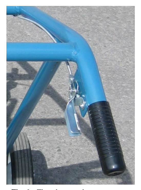
Fig. 6 Throttle control

The throttle is located on the right hand side (see Fig. 6). To actuate choke, lever must be in fully contracted position (all the way down). Push the throttle control slightly to find full throttle position, and pull farther up for lower speed settings. To stop the engine, pull all the way up on control lever. Lowering control lever increases the engine speed. Raising the control lever decreases the engine speed.