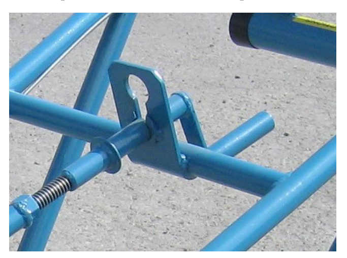
Fig. 3 Planer in idle position

After checking the planer disc and blocks (refer to the planer block installation section), put the depth control in the idle position and make certain the control is set so that the blocks do not come in contact with the roof deck (see Fig. 3). Pushing Down on the handles will allow the depth control to slide to the idle position.