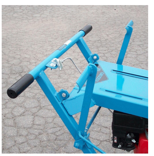
Fig. 3 Levers in brake on, clutch disengaged position

Make sure the clutch and brake levers aren't being pulled back (held) against the handle bar (pulling on the brake lever will release the brake and engage the clutch) (See Fig. 3)