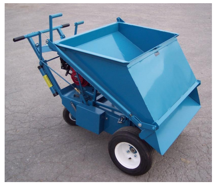
340 500 Gravel dispenser

Install channel irons, tank and rods as shown in Fig. 7 (Refer to operation section on use of hot tanks)