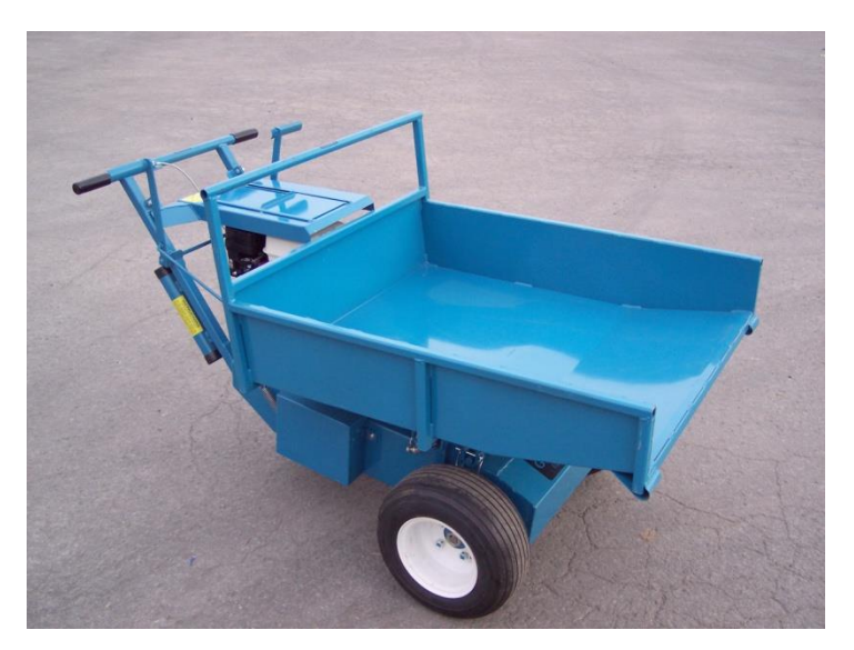
#340 700 Dump tray