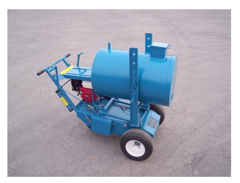
Fig. 7 Hot stuff tank attachment

Install channel irons, tank and rods as shown in Fig. 7 (Refer to operation section on use of hot tanks)