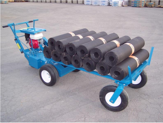
#340 400 Platform