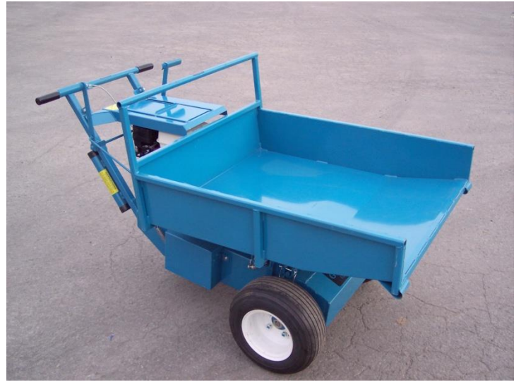
#340 700 Dump tray