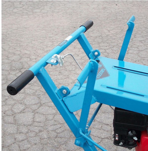
Fig. 3 Levers in brake on, clutch disengaged position

Make sure the clutch and brake levers aren't being pulled back (held) against the handle bar (pulling on the brake lever will release the brake and pulling on the clutch lever will release the brake and engage the clutch) (See Fig. 3)