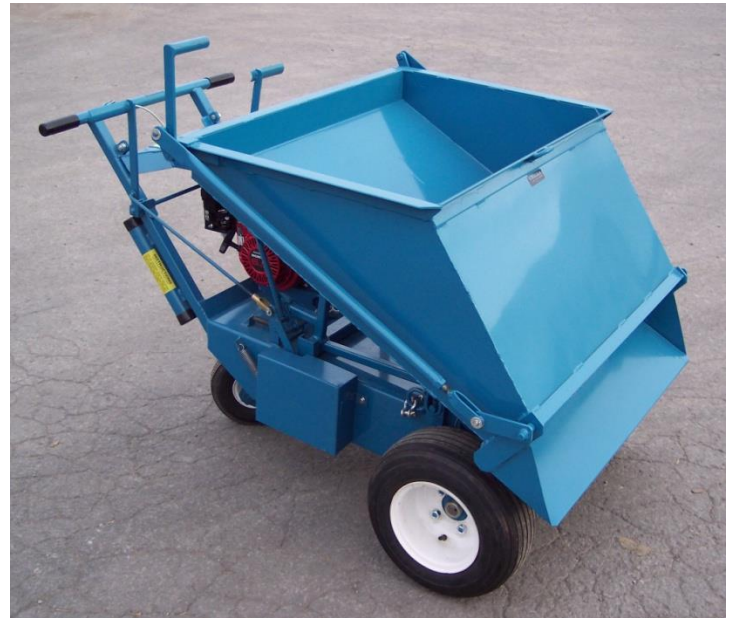
340 500 Gravel dispenser

Install channel irons, tank and rods as shown in Fig. 7 (Refer to operation section on use of hot tanks)