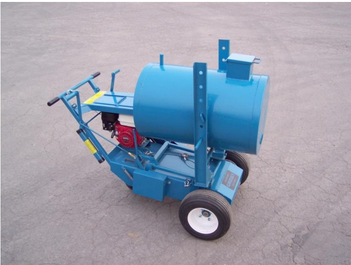
Fig. 7 Hot stuff tank attachment

Install channel irons, tank and rods as shown in Fig. 7 (Refer to operation section on use of hot tanks)