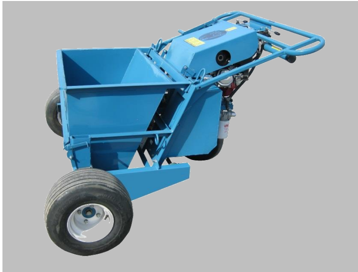
Fig. 5 Gravel spreader

Wrenches are required for installation. Install gravel spreader as shown in fig. 5. Shaft ends of spreader drop into mount brackets on the frame. To install handle and linkage, first attach linkage to dispenser and then connect the other end with handle and secure with bolt and nut provided. Clockwise adjustment of the screw will make dispenser door open less; counter-clockwise makes door open more. Yoke assembly on back of dispenser is preset to proper door tension. If more tension is needed for door closure, remove the bolt and nut on the yoke and tighten as needed.