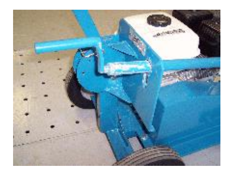
Fig. 5 Depth control in operating position

Be sure to test the shut-off switch before depending on it (see Fig. 6), the shut-off switch is located on the back-side of Honda engine.