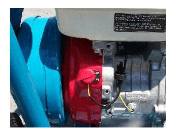
Fig. 6 Shut-off switch

Be sure to test the shut-off switch before depending on it (see Fig. 6), the shut-off switch is located on the back-side of Honda engine.