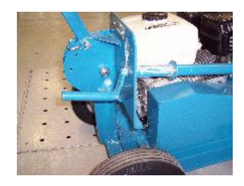
Fig. 4 Depth control in idle position

The depth control (see Fig. 4 and Fig. 5) is located on the right side of the handle assembly. Figure 4 shows the control in the idle position and figure 5 shows the cutting position. Turning the crank clockwise adjusts the cutting depth lower; counterclockwise rotation of crank raises the cutting blade. Operator must be familiar with operation of this control before using roof cutter on the job.