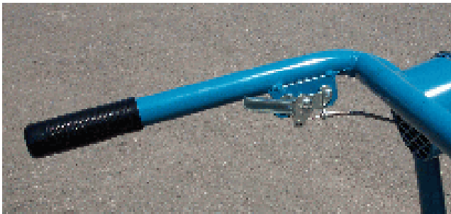
Fig. 6 Throttle control

The throttle is located on the left hand side (see Fig. 6). Lowering lever handle decreases the engine speed. Raising the lever increases the engine speed.