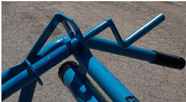
Fig. 3 Roof Cutter in idle position

After checking the blade installation (refer to the blade installation section), put the depth control in the idle position and make certain the control is set so that blade does not come in contact with the roof deck (Fig. 3) Pushing down on the handles will allow the depth control to slide to the idle position.