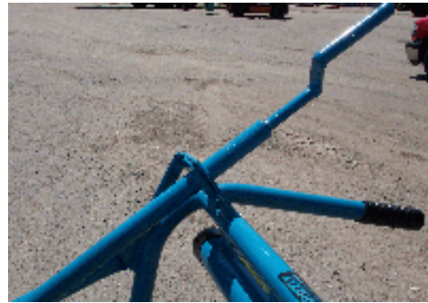
Fig. 5 Depth control in operating position