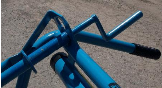
Fig. 4 Depth control in idle position

The throttle is located on the left hand side (see Fig. 6). Lowering lever handle decreases the engine speed. Raising the lever increases the engine speed.