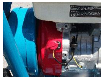
Fig. 7 Shut-off switch

Be sure to test the shut-off switch before depending on it (see Fig. 7), the shut-off switch is located on the back-side of Honda engine.