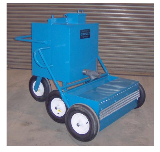
Fig. 3 Fig. 4